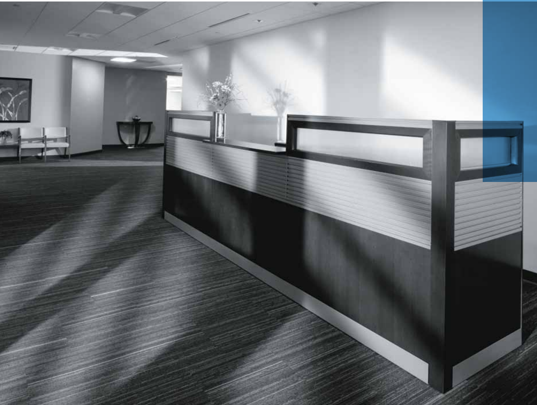
Xsite® reception desk with Beo® tandem seating and in-line table.