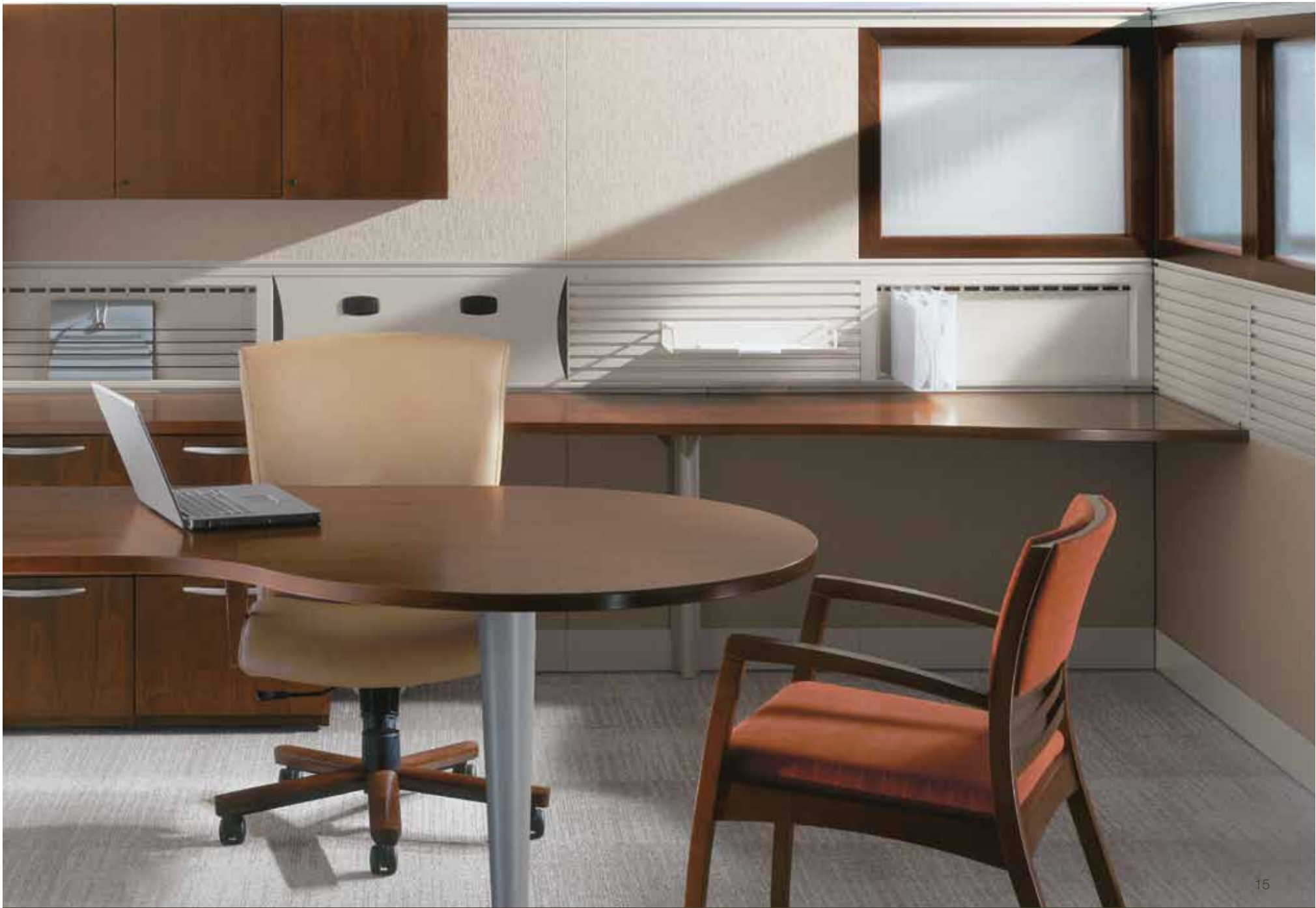
tiles: reflection quartz; trim: inside: fog, outside: environmental grey; Footprint® worksurfaces and storage: american walnut; seating: Stature® outback sand and Beo® Pollack Skive carrot.