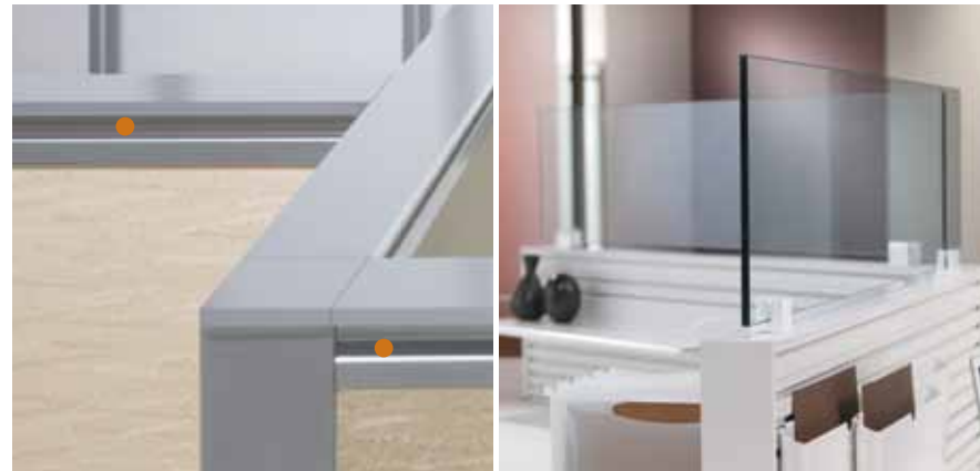
● Traxx integration for off-module connection

Footprint flat profile cubby storage units let you keep hot projects close at hand.