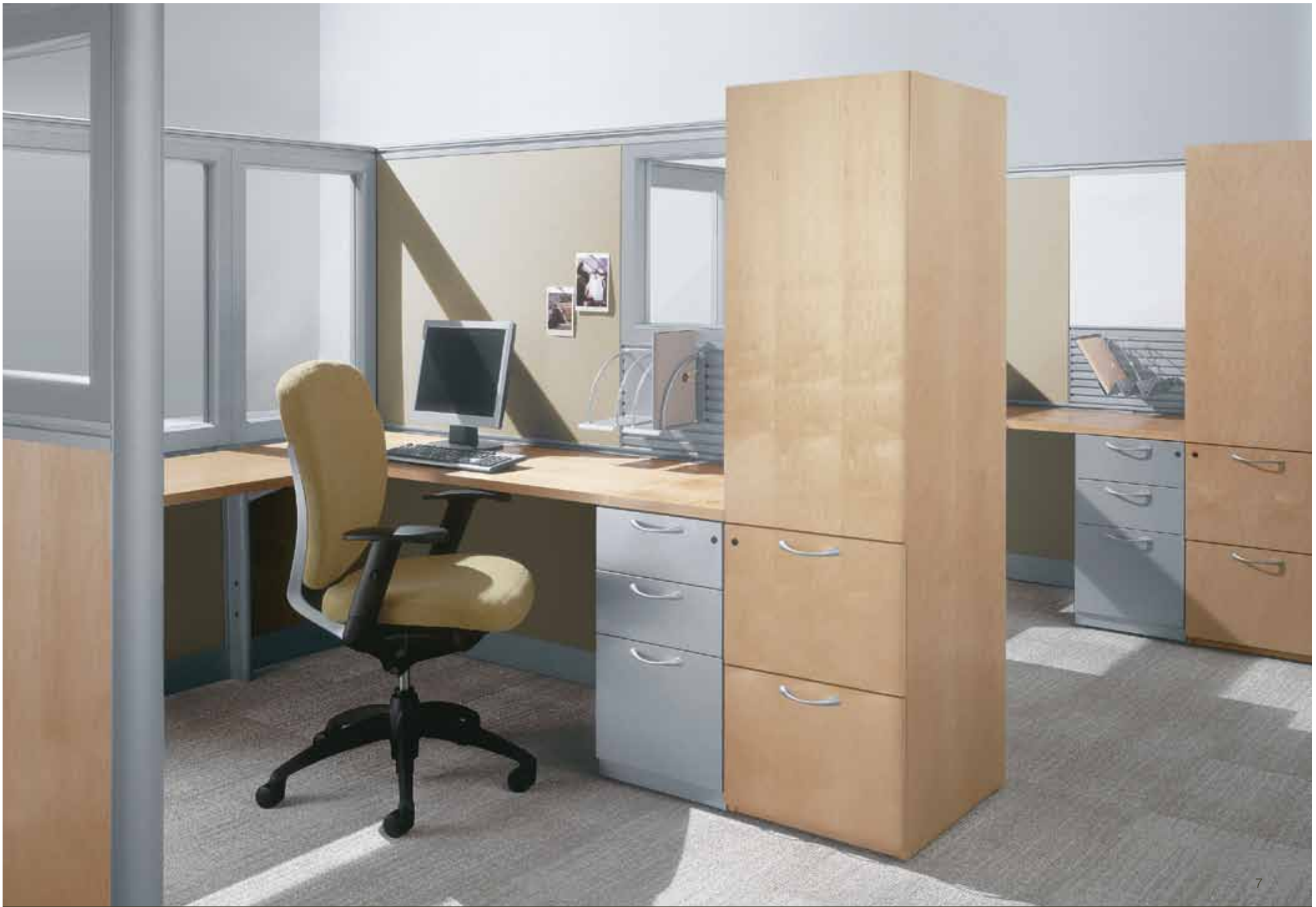
tiles: terra plus meadow; trim and storage: platinum metallic; Footprint® worksurfaces and storage: natural maple; seating: Wish™ Pollack Skive lime.