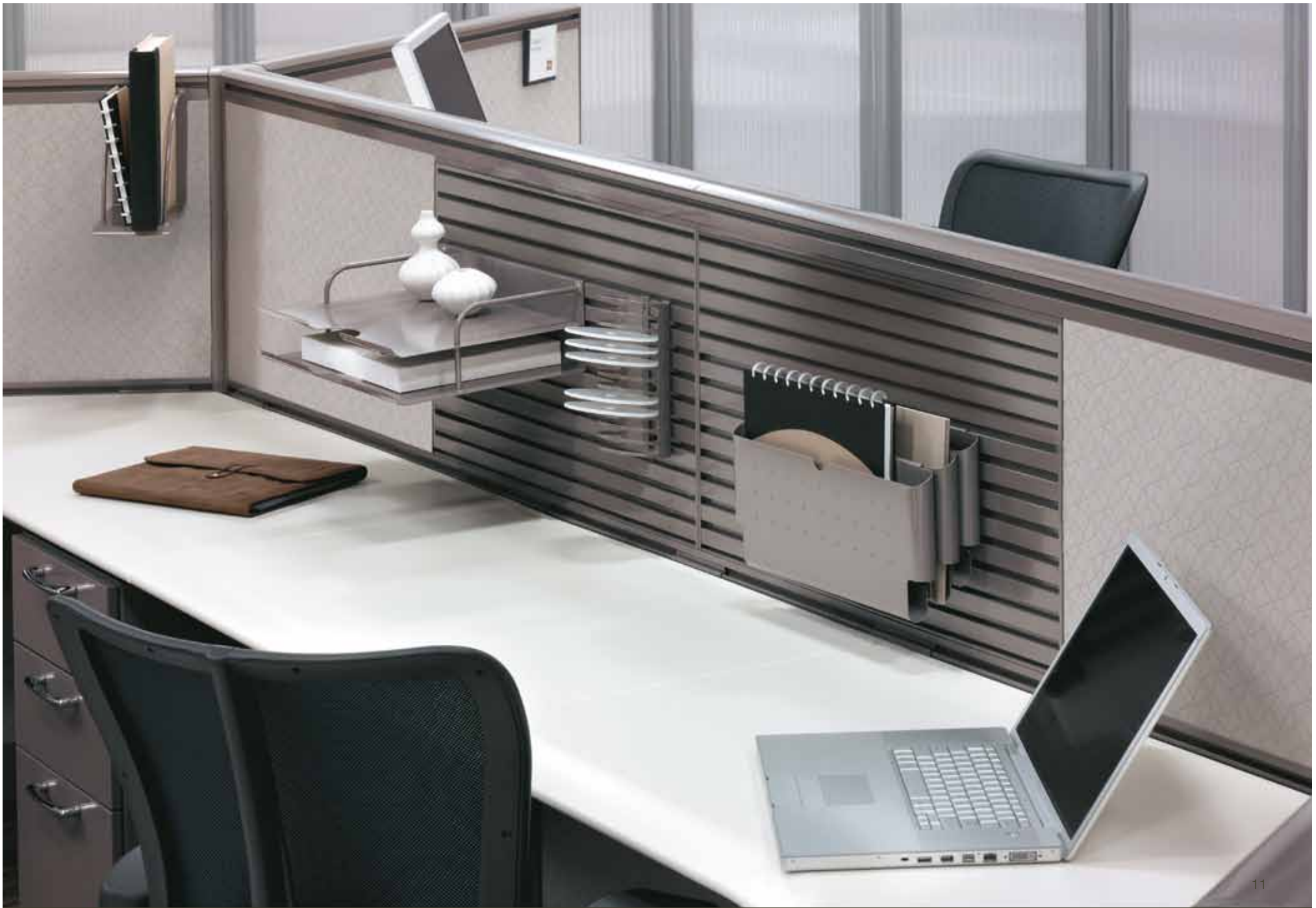
Xsite tiles: Momentum Tracery Brindle; slat tile and trim: patina metallic; shown with Footprint® worksurfaces and storage; seating: Skye®, Perks® accessories.